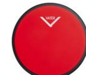
CHOP BUILDER 12" SOFT SINGLE SIDE PRACTICE PAD VCB12S

12 inch soft practicing surface. Reverse side features a non-skid rubber base.