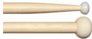
TENOR STICK SIZZLE Mallet MVTS-1SZL

Length 16 1/2" | 41.91cm Grip 0.680" | 1.73cm Tip Nylon