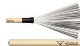
WOOD HANDLE VWTW