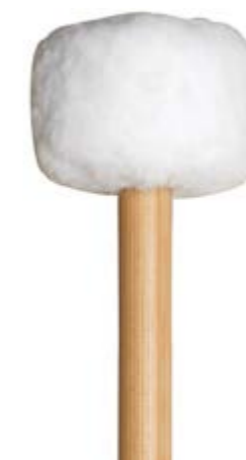
GONG CYMBAL Mallet MV-GM1

Length 16 1/2" | 41.91cm Grip 0.950" | 2.41cm Head Puff Fleece