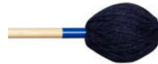
SOFT MARIMBA Mallet V-CEM10S V-CEM10S

Oval shaped models feature hard rubber cores that produce a rich sonority. 5/16" satin finished birch handles with graduated sized heads and proportionate weights for effortless projection and great speed over the entire instrument.