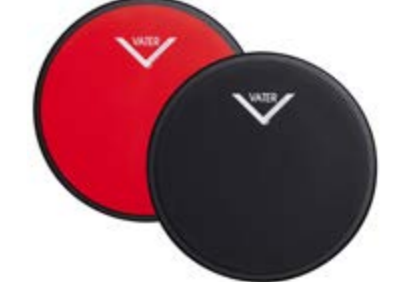
CHOP BUILDER 12" DOUBLE SIDED PRACTICE PAD VCB12D

12 inch double-sided pad. Hard on one side and soft on the other.