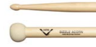
SIZZLE FUSION™ ACORN Ultra Staccato VSZLF

Length 16 1/4" | 41.27cm Grip 0.580" | 1.47cm Tip Acorn