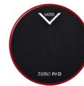
ZERO PAD VCBZ

The Zero Pad's plush surface material and 3/4" thickness gives drummers another pad offering that has minimal rebound as compared to a traditional gum rubber pad - making the player focus, fine tune and strengthen their sticking mechanics and technique.