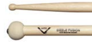
SIZZLE FUSION™ Ultra Staccato VSZLF

Length 16 1/4" | 41.27cm Grip 0.580" | 1.47cm Tip Ball