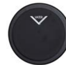
CHOP BUILDER 6" HARD SINGLE SIDE PRACTICE PAD VCB6H

6 inch Hard practicing surface really helps you hear your sticking. Reverse side features an 8mm screw to mount on a cymbal stand and a non-skid rubber base.