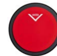
CHOP BUILDER 6" SOFT SINGLE SIDE PRACTICE PAD VCB6S

6 inch Soft practicing surface. Reverse side features an 8mm screw to mount on a cymbal stand and a non-skid rubber base.