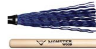
MONSTER WOOD VBMW

Length 14 1/4" | 36.20cm Grip 0.605" | 1.54cm Type Polymer