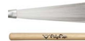
POLY FLEX VPFLX

Length – Grip 0.605" | 1.54cm Type Polymer