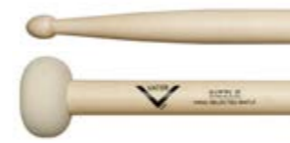
SIZZLE Ultra Staccato VMSZL