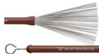
BEANTOWN BRUSH VWTB

Length 14" | 35.56cm Grip 0.530" | 1.35cm Wire Steel