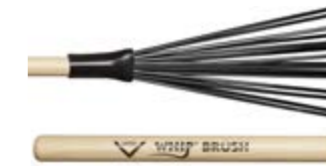
WHIP BRUSH VWB

Length – Grip 0.605" | 1.54cm Type Polymer