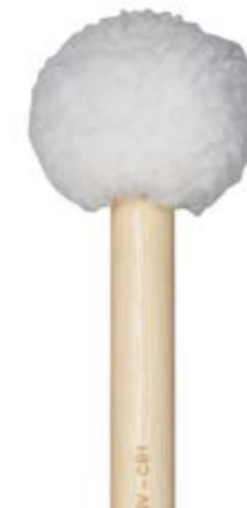
CONCERT BASS DRUM Mallet MV-CB1

Features a unique reverse tapered shaft that allows for easier control in the grip area while creating more weight towards the mallet head. The medium large Puff Fleece mallet head produces a warm, low, full sound yet will yield great articulation at all volumes. Grip diameter measures .750" and tapers to .900" right after the gripping area of the handle.