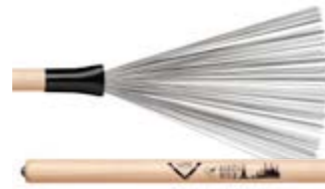
MANHATTAN BRUSH VWTM

Length 14" | 35.56cm Grip 0.530" | 1.35cm Wire Steel